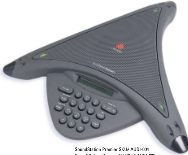
SoundStation Premier SKU# AUDI-004 SoundStation Premier EX SKU# AUDI-005

In large organizations, getting things done often requires contributions from many people. Audio-conferencing is an efficient, cost-effective way to keep everyone “in the loop.” Unfortunately, with most audioconferencing systems, the more people that participate in a conference, the more technology gets in the way of productivity. Now there’s a clear solution: SoundStation Premier from Polycom.